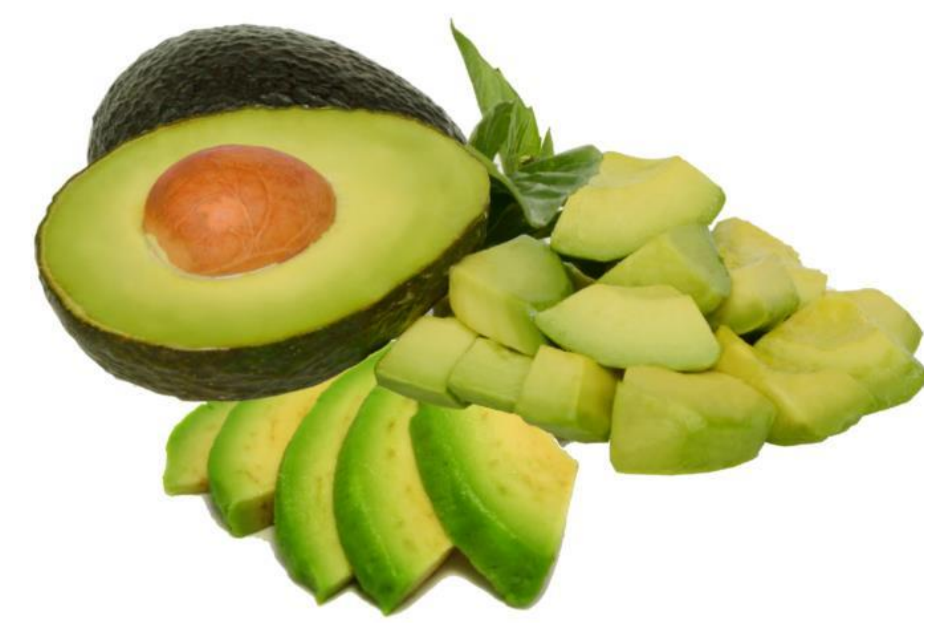
IQFF Individual Quick Food Freezing